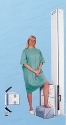
Shown with optional hospital-grade wall stand