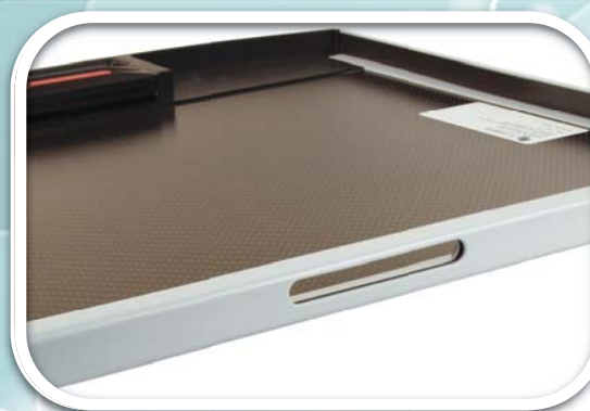
Custom Utility Ports